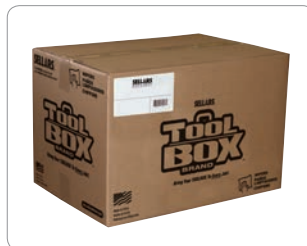
Z300 GreenX Series 1/4 Fold Outer Case