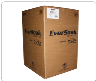
Preferred Split Roll Outer Case

Caution: Not intended for use with aggressive acids or caustics. Dispose of all sorbent materials in accordance with local, state and federal regulations.