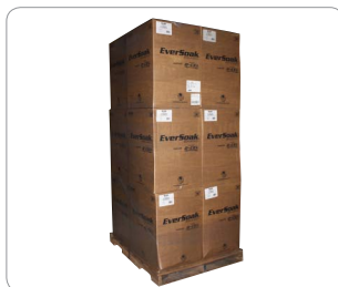
Preferred Split Roll Outer Case on a Pallet